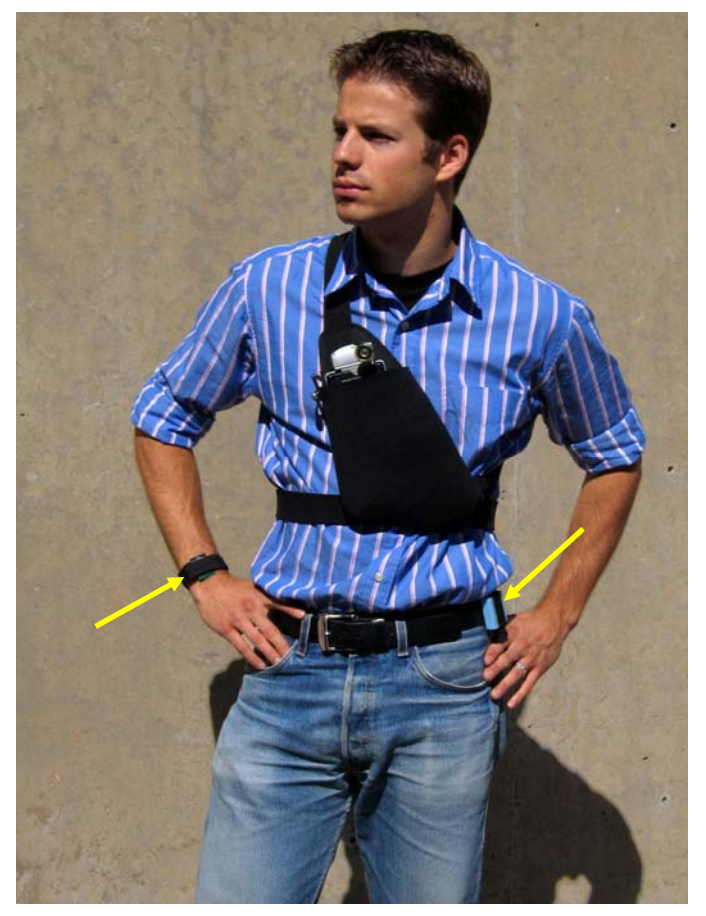
Figure 1: Sensor placement

We believe that this minimal set of sensors is sufficient to classify many interesting dimensions of context. This assumption is supported by previous work in wearable computing [10,11].