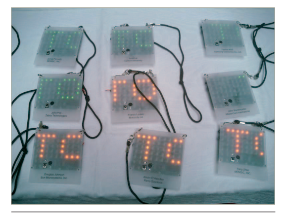
Figure 1: The Laibowitz and Paradiso Uberbadge. This badge-like platform allows social context sensing by IR, audio, and motion so that wearers can automatically bookmark interesting people and demonstrations, and it displays messages designed to build social networks.