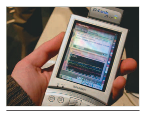
Figure 2: The GroupMedia system. The system, built around a Sharp Zaurus PDA, measures attraction signaling in a dating and other social events. The system can also provide feedback to users and patch remote users in to interesting or socially important conversations. The interface in the image, which is still in the experimental stage, is a split screen of messages and biosignals from another user.