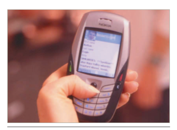
Figure 3: The Serendipity system. Built on the Nokia 6600 phone, the system senses the proximity of other people and compares their interests to make socially appropriate introductions.

By quantifying the influence each participant has on the other, we obtain a measure of their engagement. To measure these influences, we use an HMM to model their individual turn taking and measure the coupling of these two dynamic systems to estimate the influence each has on the other's turn-taking dynamics.<sup>8</sup>